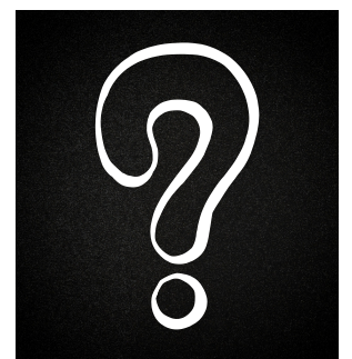
YOU! communications & Campaigns officer?

You can also contact us by emailing su@ucenmanchester.ac.uk